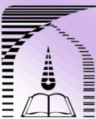
Tarbiat Modares University